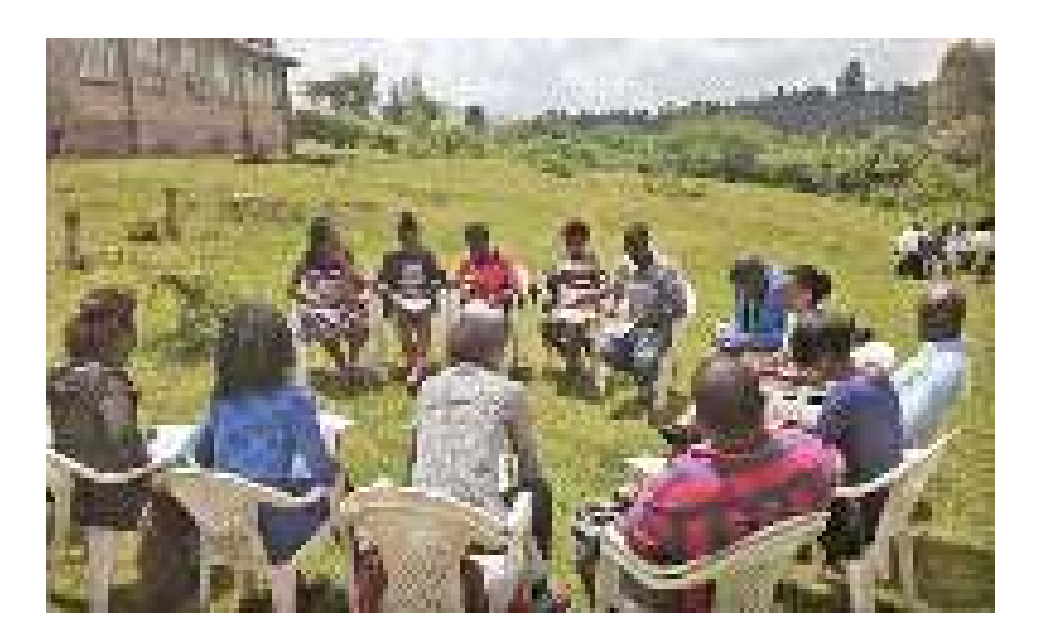
Figure 17: Youth during an inter-community exchange programme

455. The Directorate further promoted national unity by conducting 2 inter-community youth exchange programmes involving 100 youth leaders drawn from Nandi and Machakos and from Bomet and Trans Nzoia counties. The fora provided a platform for participants' exposure to diverse cultural backgrounds, facilitated cross cultural learning and appreciation of harmonious co-existence.