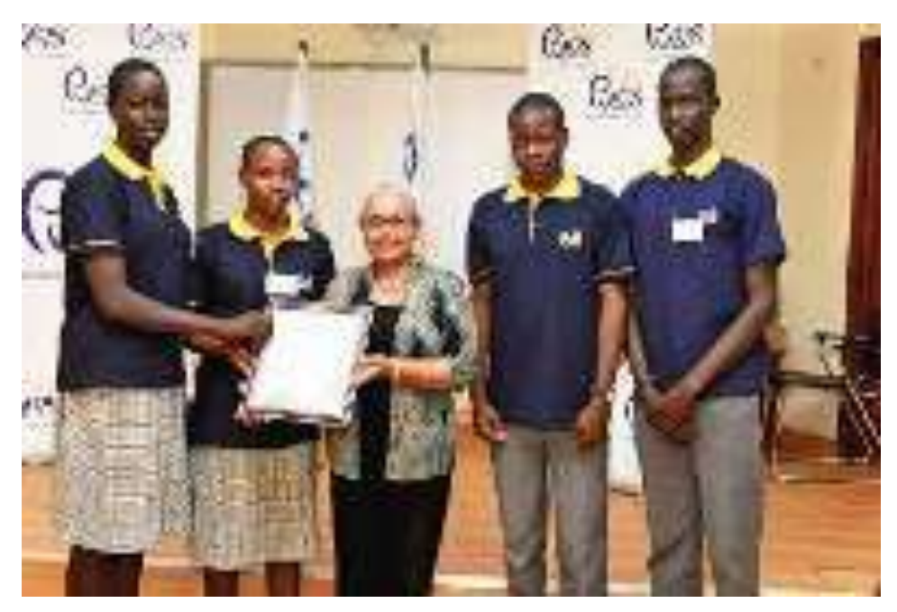
Figure 6: The First Lady with some of the beneficiaries of PURES

year 2016 as reflected in Figure 6. The programme recognizes top performing KCPE students in every county.