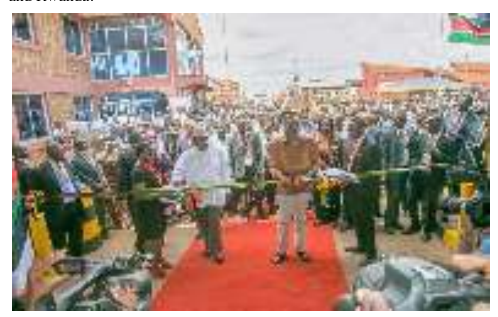
Figure 12: One-Stop Border Posts (OSBP) in Busia

commissioned by H.E. the President and his Ugandan counterpart as shown in Figure 9. The Authority also launched the Regional Electronic Cargo Tracking System to facilitate tracking of transit cargo from Mombasa Port through an online platform monitored in Kenya, Uganda and Rwanda.