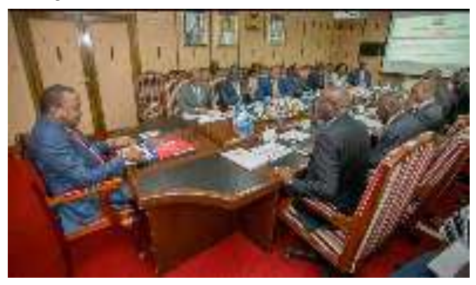
Figure 15: H.E the President with Energy sector stakeholders

406. The National Oil Corporation of Kenya (NOCK) established oil and gas infrastructure and built capacity of Kenyans to participate in the upstream oil and gas sector. The Corporation enhanced access to Liquified Petroleum Gas in the country to provide Kenyans with clean and affordable energy to improve quality of life. In addition, the Corporation conducted oil and gas exploration activities to develop the national petroleum resources and partnered with communities to develop oil and gas resources.