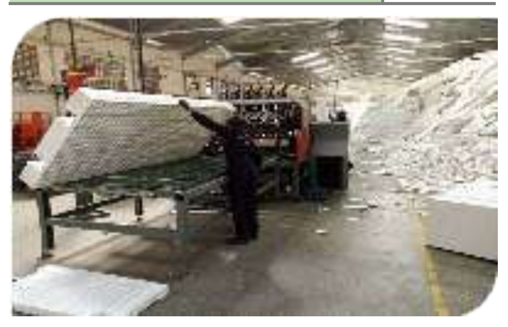
Figure 23: Expanded Polystyrene (EPS) Factory