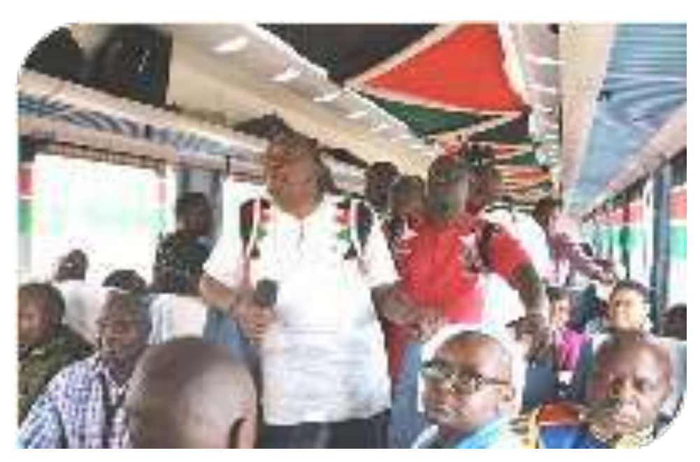
Figure 20: H.E the President aboard the inaugural Madaraka Express

685. H.E. the President commissioned Phase I of the 472km SGR from Mombasa to Nairobi and took a day long inaugural ride aboard the Madaraka Express train. The ground breaking for Phase 2A from Nairobi to Naivasha was undertaken and construction work is ongoing. Further, the development and construction of 26 new modern passenger terminals including Syokimau, Makadara and Imara Daima were completed and operationalised.