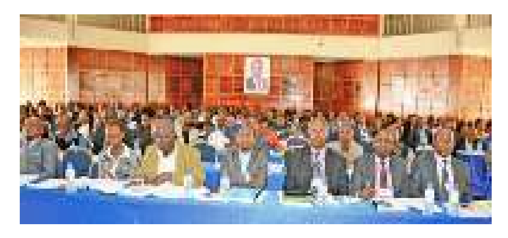
Figure 3: Validation of the 2017Annual Report by MCDAs at KICD