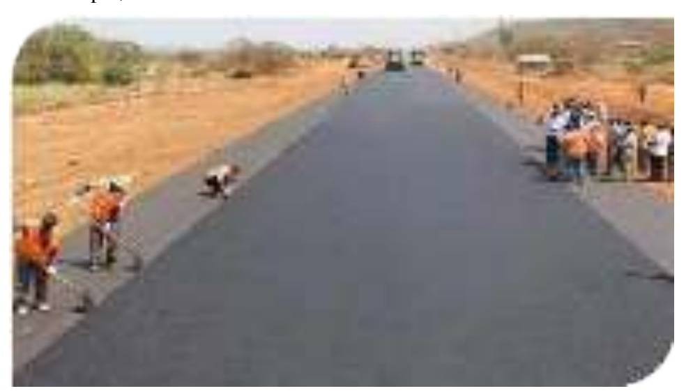
Figure 22: Construction of the Kibwezi- Mutomo- Kitui Highway

699. The KeNHA conducted EIA for 7 new road projects that are under review by NEMA for issuance of licenses. Further, the Authority undertook the construction of 8 key road projects under the Vision 2030 Flagship including: Miritini-Mwache-Kipevu; Kibwezi-Mutomo-Kitui (Figure 22); Lokitaung Junction-Kalobeiyei River-Lodwar; Kalobeiyei River-Nadapal; and James Gichuru-Rironi.