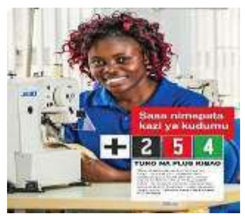
Figure 5: An advertisement on the +254 campaign

29. The Brand Kenya Board implemented Phase I of an integrated Marketing and Communication Campaign dubbed "+254 Tuko Na Plus Kibao" as illustrated in Figure 5. This is aimed at unifying and rallying Kenyans towards participating in nation building.