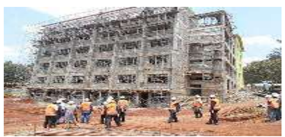
Figure 16: Construction of Tuition Block Phase II at MUT