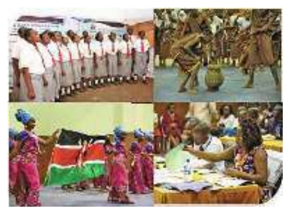
Figure 4: 2017 Music Festivals

employment opportunities for the youth. Further, the Teachers Service Commission (TSC) sponsored a category in the 2017 Kenya Music Festival titled "The role of teachers in promoting ethical culture through dissemination of national values". Separately, the Kenya Film Classification Board in partnership with Vision Media Production Company implemented a project dubbed Sinema Mashinani to promote Kenya's culture and moral values besides creating jobs and wealth for the youth.