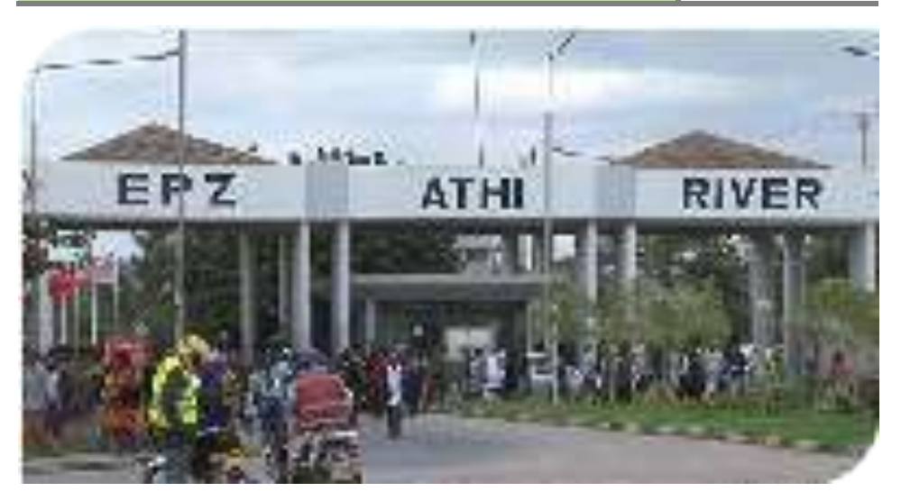
Figure 25: The Export Promotion Zones at Athi River