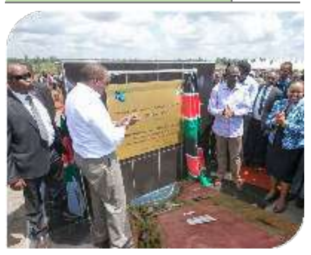
Figure 13: Launch of the Thiba Dam Project in Kirinyaga County