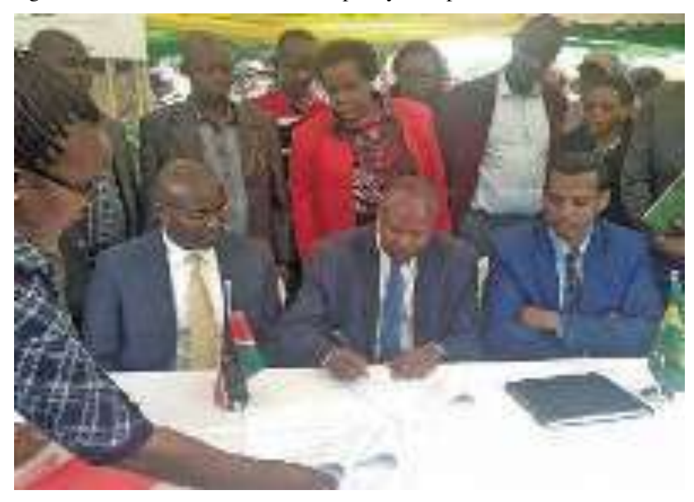
Figure 8: Kericho County Governor signing MoU with KEMSA

improve capacity to provide services at each level of the healthcare system. The KEMSA signed MoUs with 47 counties while KEMRI signed MoUs with 17 counties on capacity for operational research.