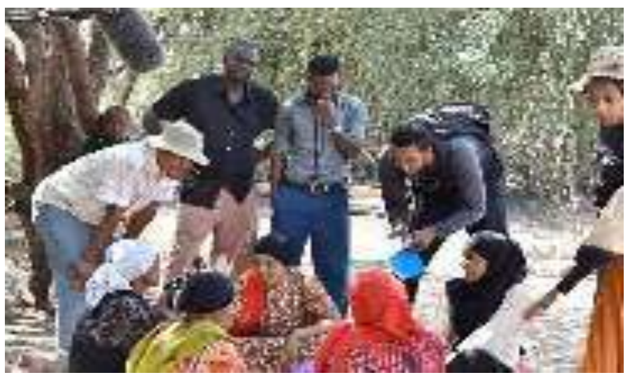
Figure 19: A scene in the movie Simale